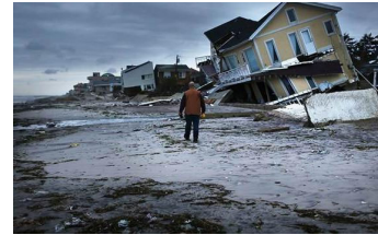
BLOG .INFO: events and registrations